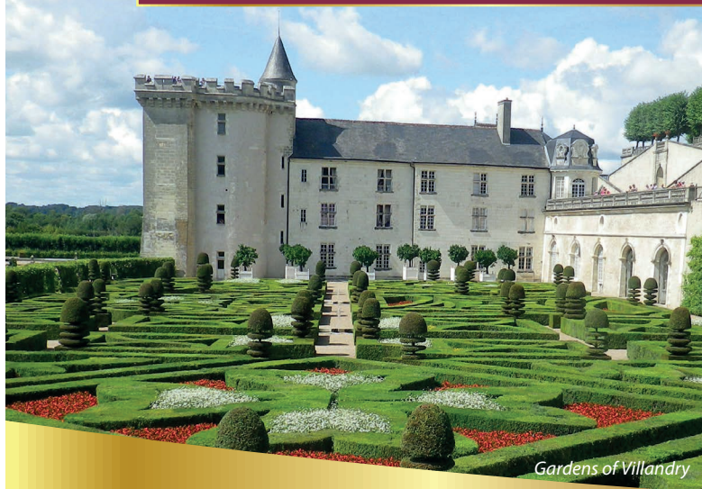
Gardens of Villandry