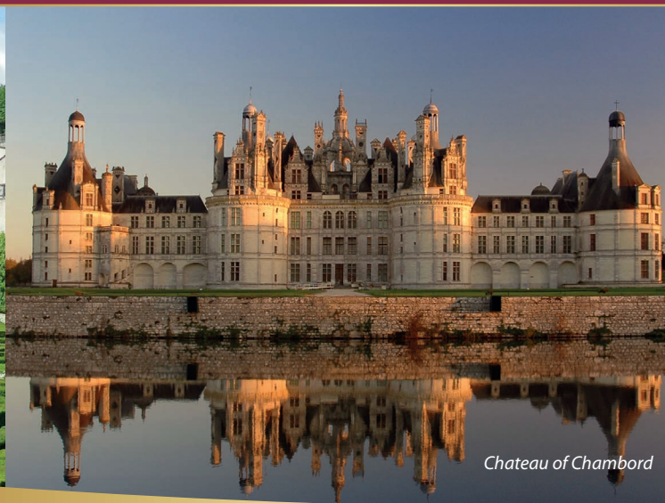
Chateau of Chambord