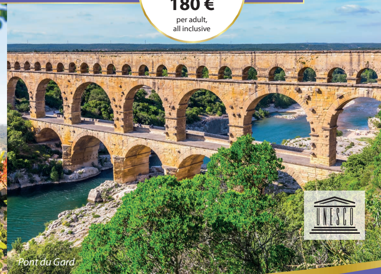
Pont du Gard